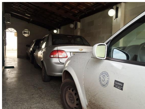
SEATECH'S CARS 1-2