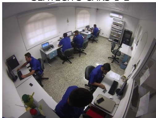
OPERATIONS ROOM 1-2