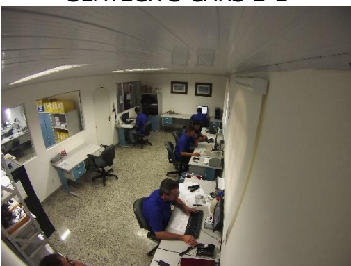
OPERATIONS ROOM 2-2