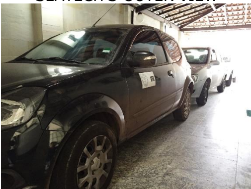
SEATECH'S CARS 2-2