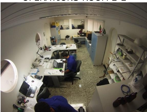
MANAGEMENT ROOM 2-2