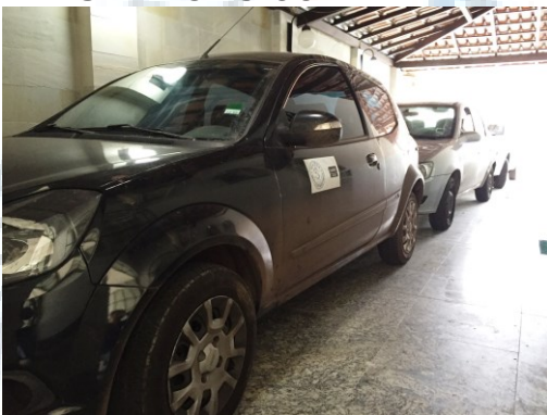
SEATECH'S CARS 2-2