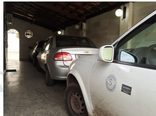
SEATECH'S CARS 1-2