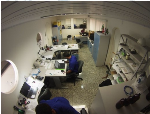
MANAGEMENT ROOM 2-2