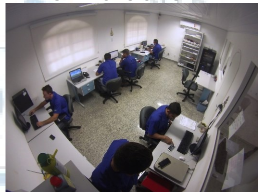
OPERATIONS ROOM 1-2