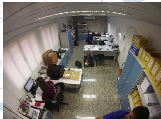
MANAGEMENT ROOM 1-2