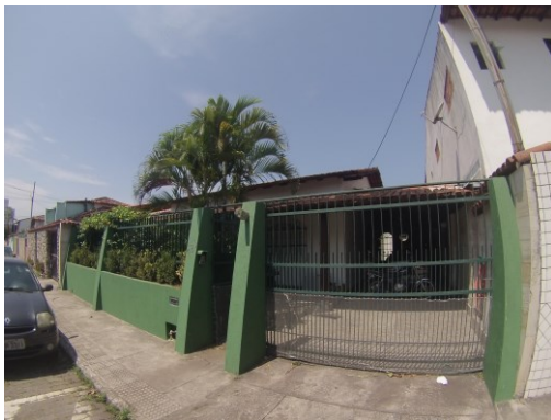
SEATECH'S OUTER VIEW