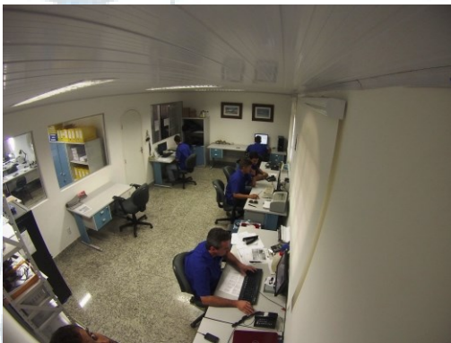
OPERATIONS ROOM 2-2